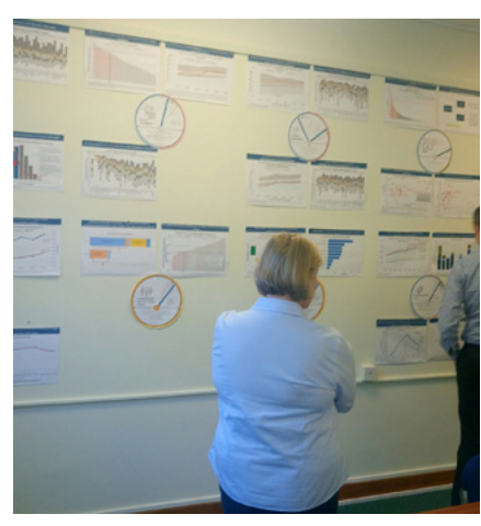
Staff reading about the 10-Year Plan in the Open Space, Hartley Library, 4th floor, Room 4061.