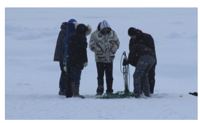
Geographers from the University on fieldwork in Alaska.

Find out more: Read the full story on SUSSED.